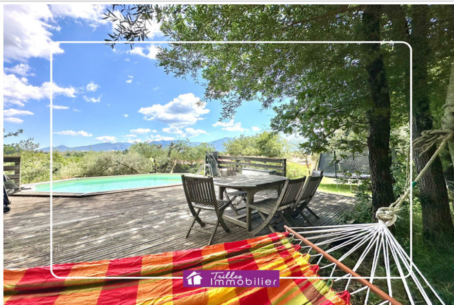
Villa 1462 Ortaffa

FAVORITE – 3-sided villa with a main house + two independent apartments built on a plot of 5,440 m² of land. Looking for an exceptional place to live, combining comfort, nature, and profitability? This unique property, nestled in the heart of nature on a 5,440 m² plot, is much more than a home: it's a true slice of paradise. The main residence: Upon entering, you will be charmed by a spacious and bright living room, enhanced by high ceilings and a warm atmosphere, giving access to a beautiful green terrace with its 5-seater jacuzzi. The open kitchen allows you to stay connected to your family or guests, while enjoying a pleasant conviviality. On the night side you will find 3 spacious bedrooms with wardrobes, a bathroom with walk-in shower and a separate toilet. Upstairs, a closed mezzanine can accommodate a 4th bedroom, an office or a games room. ✓ Ducted air conditioning throughout the house ✓ Terrace without vis-à-vis with 5-seater heated jacuzzi ✓ Large wooded garden, in absolute calm ✓ Swimming pool with breathtaking views of the mountains and the Albères ✓ Garage with electric door and workshop for DIY or storage A peaceful environment, protected by nature, perfect for recharging your batteries every day. □ Two independent apartments – guaranteed rental income On the investment side, the property offers 2 furnished apartments of 28 m² each. • Living room with equipped kitchen • Bedroom with access to a roof terrace • Bathroom with shower and WC • Each apartment has 2