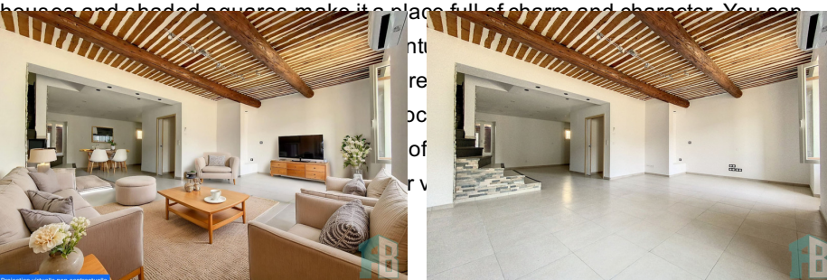
<del>300 000 € lees</del> included

For sale, magnificent village house located in the Village district of Eyguières. This charming village house category house will seduce you with its ideal location and its layout on three levels. Benefiting from a southern exposure, it offers optimal light throughout the day. With a surface area of 106 m<sup>2</sup>, this house also has a pleasant outdoor space of 60 m<sup>2</sup> to take full advantage of sunny days. Inside, you will find an equipped kitchen, ideal for preparing delicious meals with the family. Hot water is supplied by an electrical system and heating is provided by reversible air conditioning. The interior of the house has been completely renovated, offering a modern and comfortable living space. The house is semi-detached on two sides, thus ensuring a certain tranquility. The services of this house include doubleglazed windows, guaranteeing optimal sound and thermal insulation. It is composed of 3 bedrooms, a shower room, 2 toilets and a cellar. Do not miss this unique opportunity to acquire a renovated village house in a popular area of Eyguières. Contact us today to organize a visit and discover all the assets of this exceptional property. Eyguières is a charming town located in the Bouches-du-Rhône department, in the Provence-Alpes-Côte d'Azur region. At the heart of this Provençal town is a particularly attractive sector: the Village. The Village of Eyguières offers an authentic and picturesque setting. Its narrow streets, stone