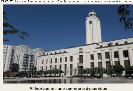
Villeurbanne : une commune dynamique