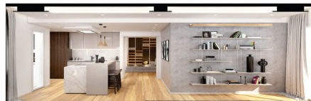
The living area looking the kitchen