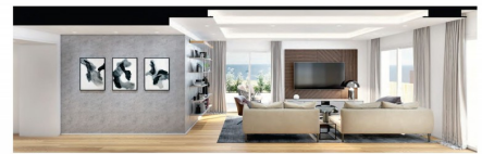
The living area