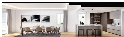
The living area looking the dining and kitchen area