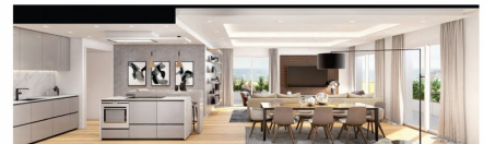
The living area