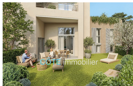
Programme neuf - Convention milancip - MLS Côte d'Azur