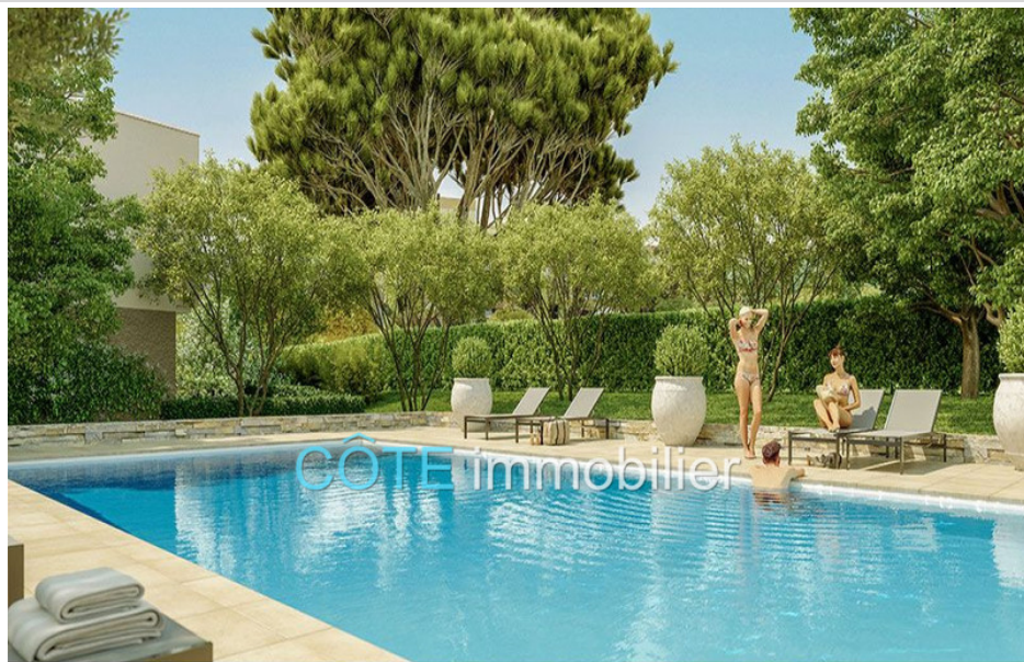
Programme neuf - Convention milancip - MLS Côte d'Azur